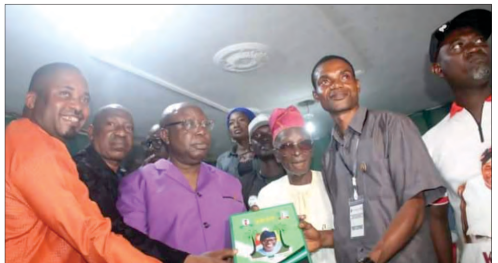
The chairman of Mushin LG and exco with the winner

He smiled home with the sum of ₦30,000 while his runners up and all the contestants went home with consolation prizes including boxes of the game.