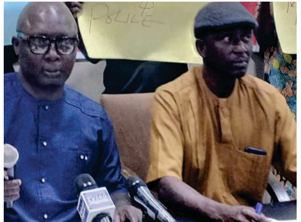
CAIDOV group at press conference

"On this note, I call on the Federal Government not to merge NSCDC with the Nigeria Police Force; doing that will be a crime against the land and this action, if implemented, would cause more harm than good. For your information, Nigeria is not the only country in the