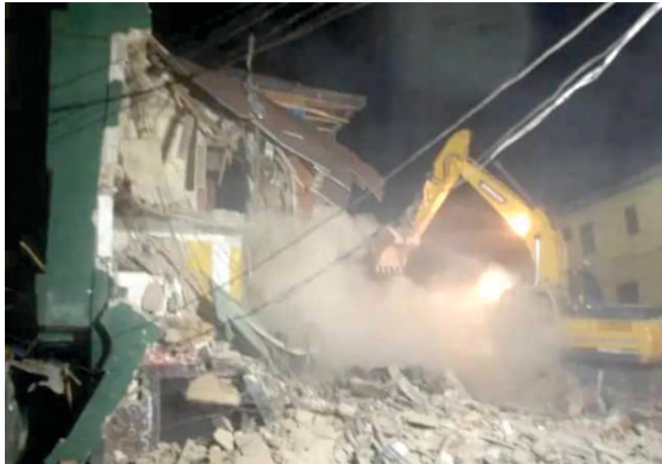
LASEMA at work