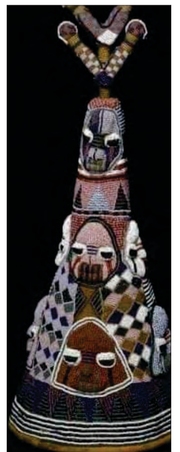
Logo of Onibeju of Ibeju-Lekki Kingdom