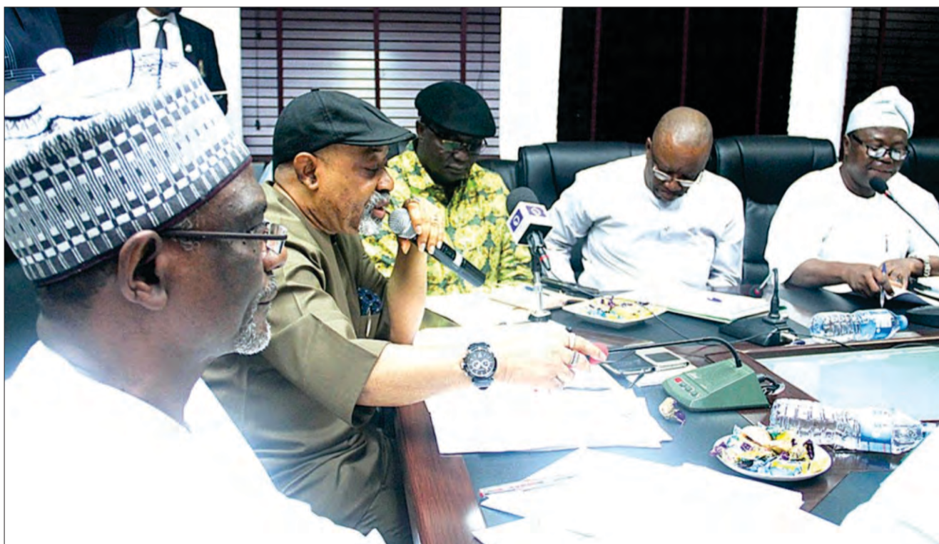
ASUU, FG in talks

Uber driver pleads not guilty over alleged N1.7m car theft