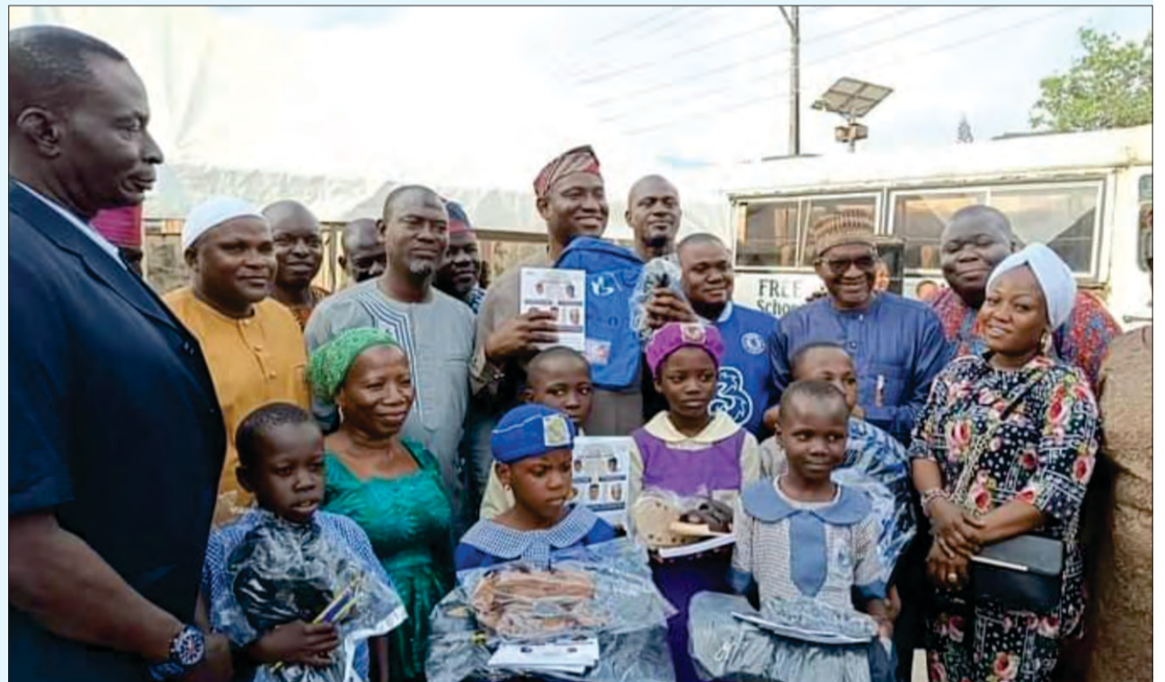
HRA, supervisor for education Odi-Olowo/Ojuwoye LCDA and the beneficiaries

programmes," he said. He encouraged the parents of the beneficiaries to ensure their children make use of the items adequately. He equally encouraged the children to use the items properly.