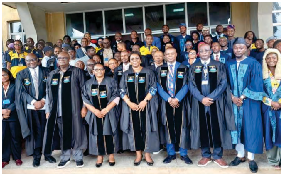
Lagos State University management and some matriculated students