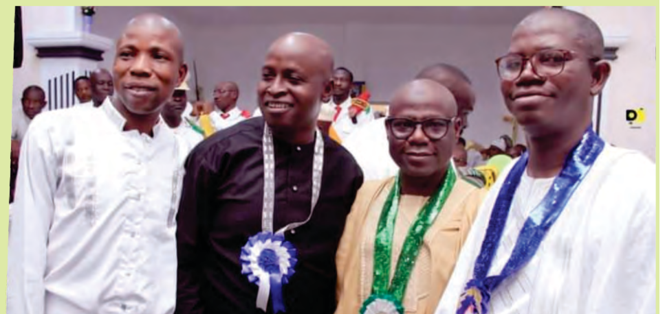
Hon. Yisa Jubril and Hon. Rasulu Idowu and religious leaders

He urged all residents to follow the trend of the party in continuously praying for their desired candidates while urging them to vote for all flag bearers of the party in Ojo Federal Constituency.