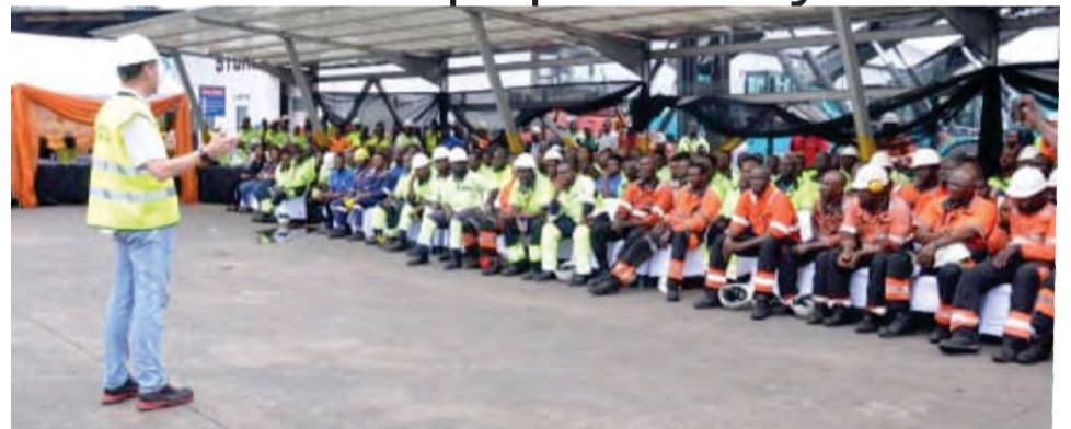
MD addressing APM Terminal staff

event to mark the company's 2022 Global Safety Day in Lagos, with the theme 'We Learn And We Adapt'.