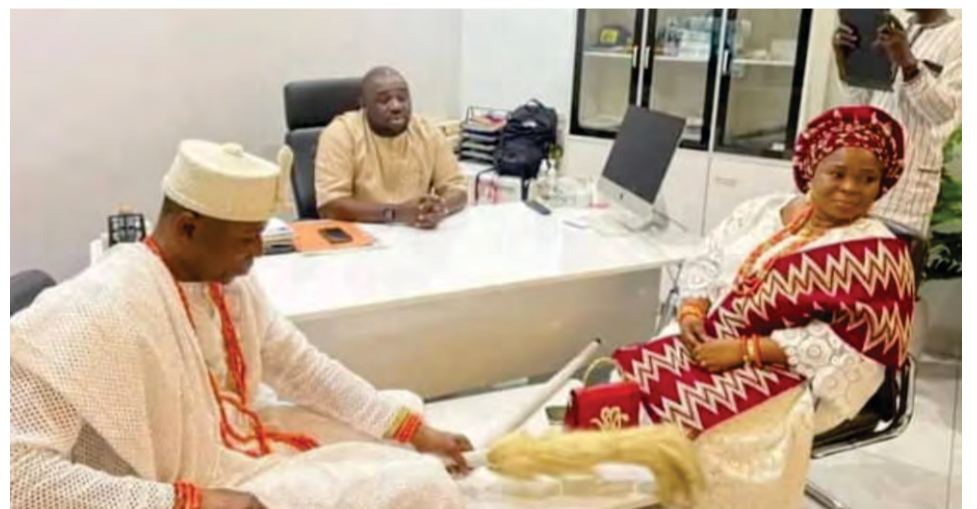
Olu of Agboyi, Oladega, wife, in Oshinowo's office

The high point of the occasion was the presentation of a thank-you letter to the council chairman.