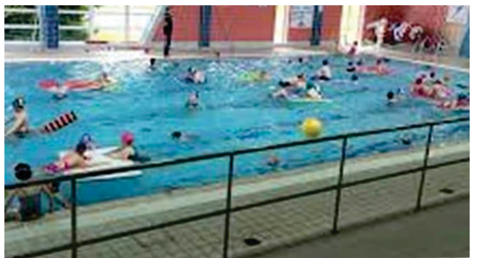
Swimming pool training to avoid drowning