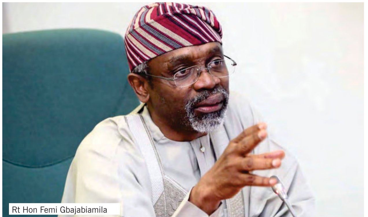
Rt Hon Femi Gbajabiamila

expected to employ active youths within the council area and reduce crimes and unemployment rate in the community.