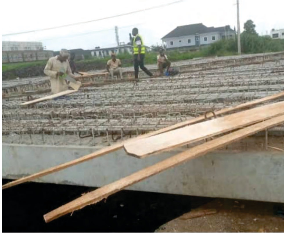
The ongoing Alapere link bridge under construction

who spoke on condition of anonymity explained that the project site beside Kosofe Local Government would be completed in about three months' time with enough commitments to handle the bulk of work remaining on the link bridge. He reiterated that daily work is ongoing at the project site to get the link bridge completed in a few weeks' time. However, he declined to give any reason behind the delay of the project. The reconstruction is expected to end gridlock and scale up the value of property in the area.